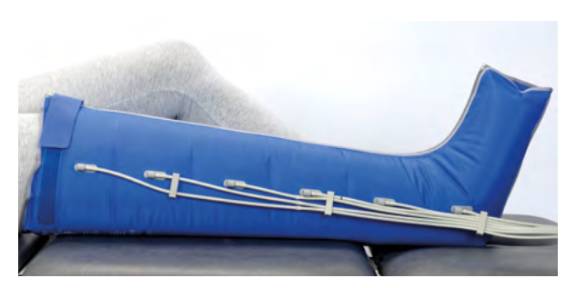
leg sleeve with 6 air chambers full-length zip, Velcro fastening Size M: thigh circumference 70 cm, length 85 cm Size L: thigh circumference 83 cm, length 85 cm

The full-length zip facilitates fitting and cleaning. An additional Velcro fastening allows an optimal adjustment to the thigh.