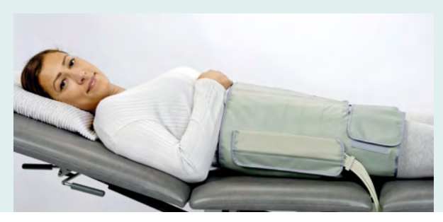
hip sleeve with 6 or 12 air chambers variable Velcro fastening on front and rear seperate air chamber for the groin hip circumference adjustable up to 150 cm, length 38 cm expansion fitting available