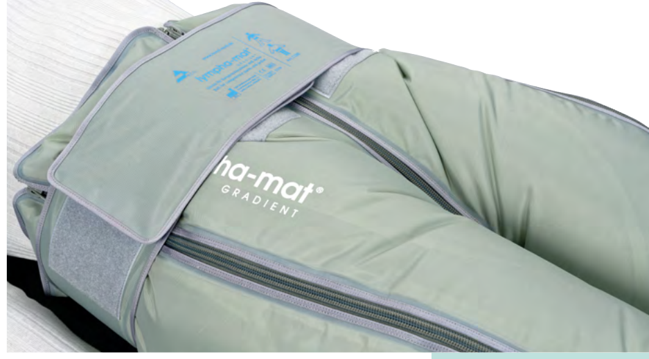
compression-trousers with 24 air chambers hip circumference up to 145 cm thigh circumference 83 cm available in size S