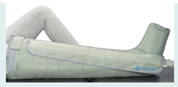
leg sleeve with 12 air chambers full-length zip, Velcro fastening Size M: thigh circumference 75 cm, length 85 cm Size L: thigh circumference 88 cm, length 85 cm available as a short version