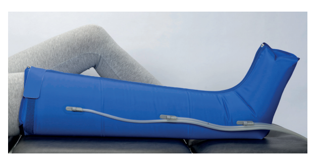
leg sleeve with 3 air chambers full-length zip, Velcro fastening Size M: thigh circumference 70 cm, length 85 cm Size L: thigh circumference 83 cm, length 85 cm

Home therapy is expedient in the case of increasing need of therapy, chronic syndromes, drug intolerance (e.g. diuretics), or intolerance of permanent compression.