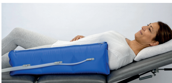
arm sleeve with 3 air chambers full-length zip upper arm circumference up to 60 cm, length 67 cm

Arm and leg sleeves have a full-length zip which facilitates fitting and cleaning. The additional Velcro fastening allows an optimal adjustment to the thigh. The hip sleeve can be changed in size individually.