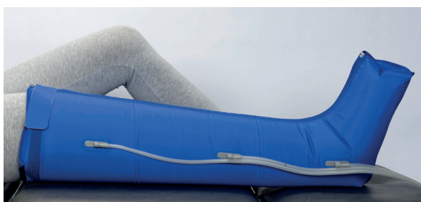
leg sleeve with 3 air chambers full-length zip, Velcro fastening Size M: thigh circumference 70 cm, length 85 cm Size L: thigh circumference 83 cm, length 85 cm