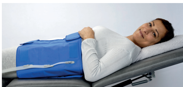
hip sleeve with 6 air chambers variable Velcro fastening on front and rear hip circumference adjustable up to 150 cm, length 38 cm

Home therapy is expedient in the case of increasing need of therapy, chronic syndromes, drug intolerance (e.g. diuretics), or intolerance of permanent compression.