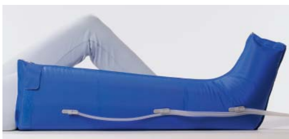
leg sleeve with 3 air chambers full-length zip, Velcro fastening Size M: thigh circumference 70 cm, length 85 cm Size L: thigh circumference 83 cm, length 85 cm