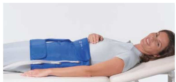
hip sleeve with 6 air chambers variable Velcro fastening on front and rear hip circumference adjustable up to 150 cm, length 38 cm

Home therapy is expedient in the case of increasing need of therapy, chronic syndromes, drug intolerance (e.g. diuretics), or intolerance of permanent compression.