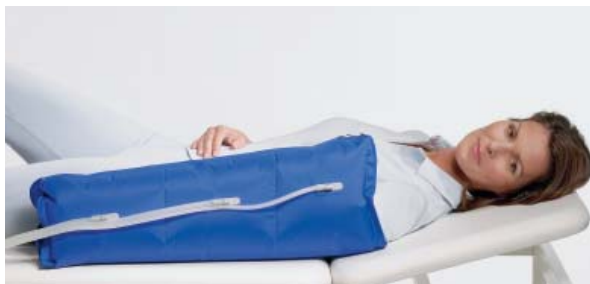
arm sleeve with 3 air chambers full-length zip upper arm circumference up to 60 cm, length 67 cm

Arm and leg sleeves have a full-length zip which facilitates fitting and cleaning. The additional Velcro fastening allows an optimal adjustment to the thigh. The hip sleeve can be changed in size individually.